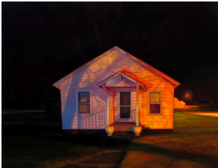
Ringling Street, oil on panel, 18x24"