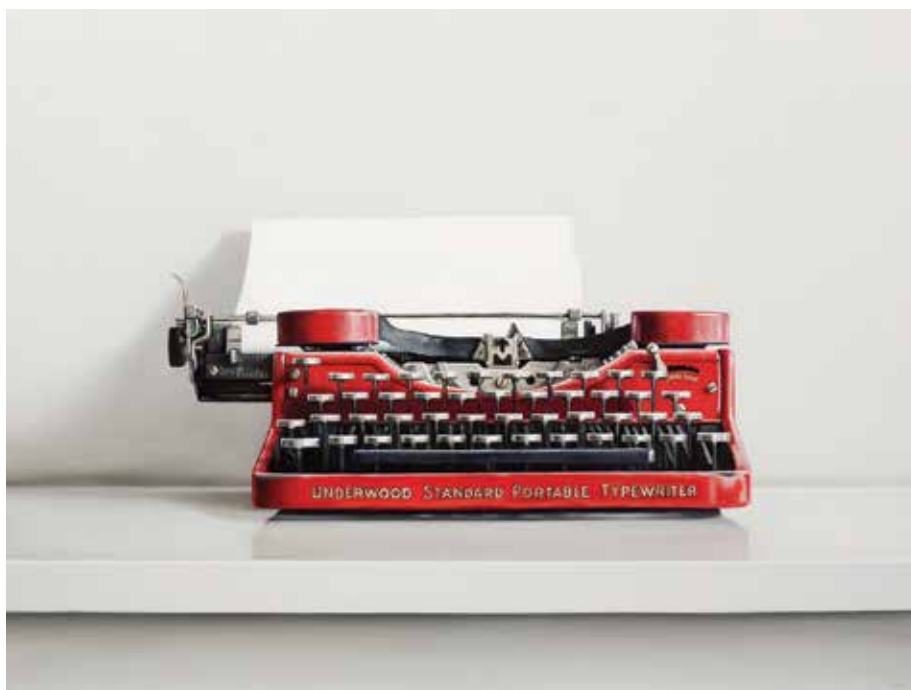
UNDERWOOD STANDARD PORTABLE TYPEWRITER