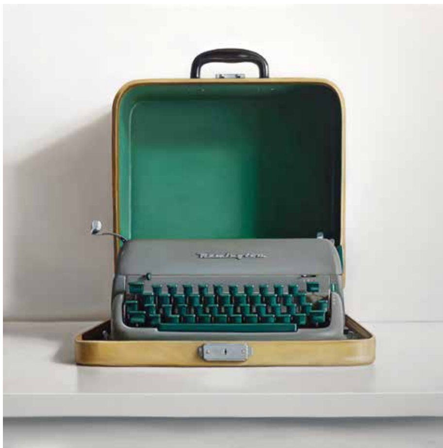
REMINGTON QUIET-RITER II