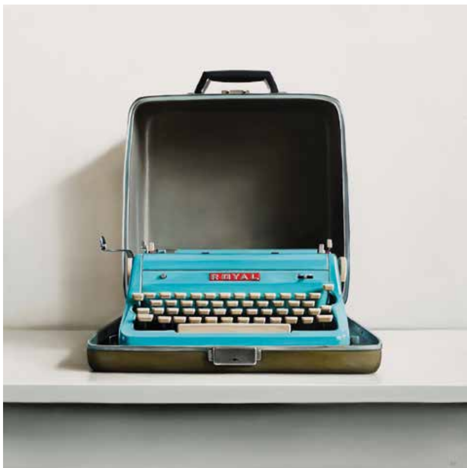
ROYAL QUIET DELUXE