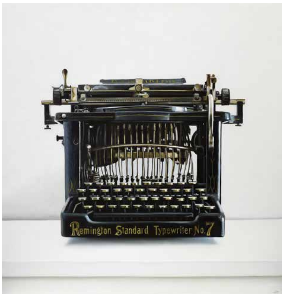
REMINGTON STANDARD NO. 7