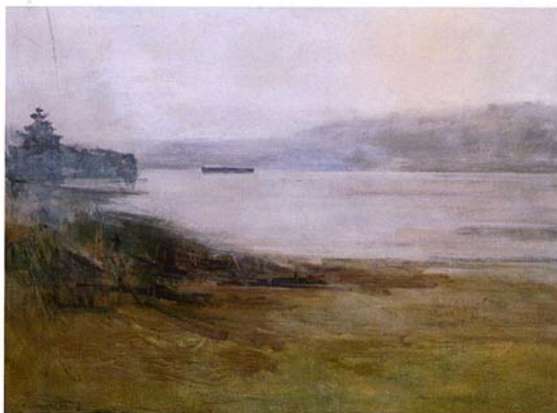
LA NIÑA, OIL ON LINEN, 50 X 70"

The Gallery Says . . . "Solmssen is the realist of an idyllic world. He reminds fortunate viewers of ideal moments existing within their grasp. Bold use of primary colors and painterly details overwhelm scenes with nostalgia for the every day."