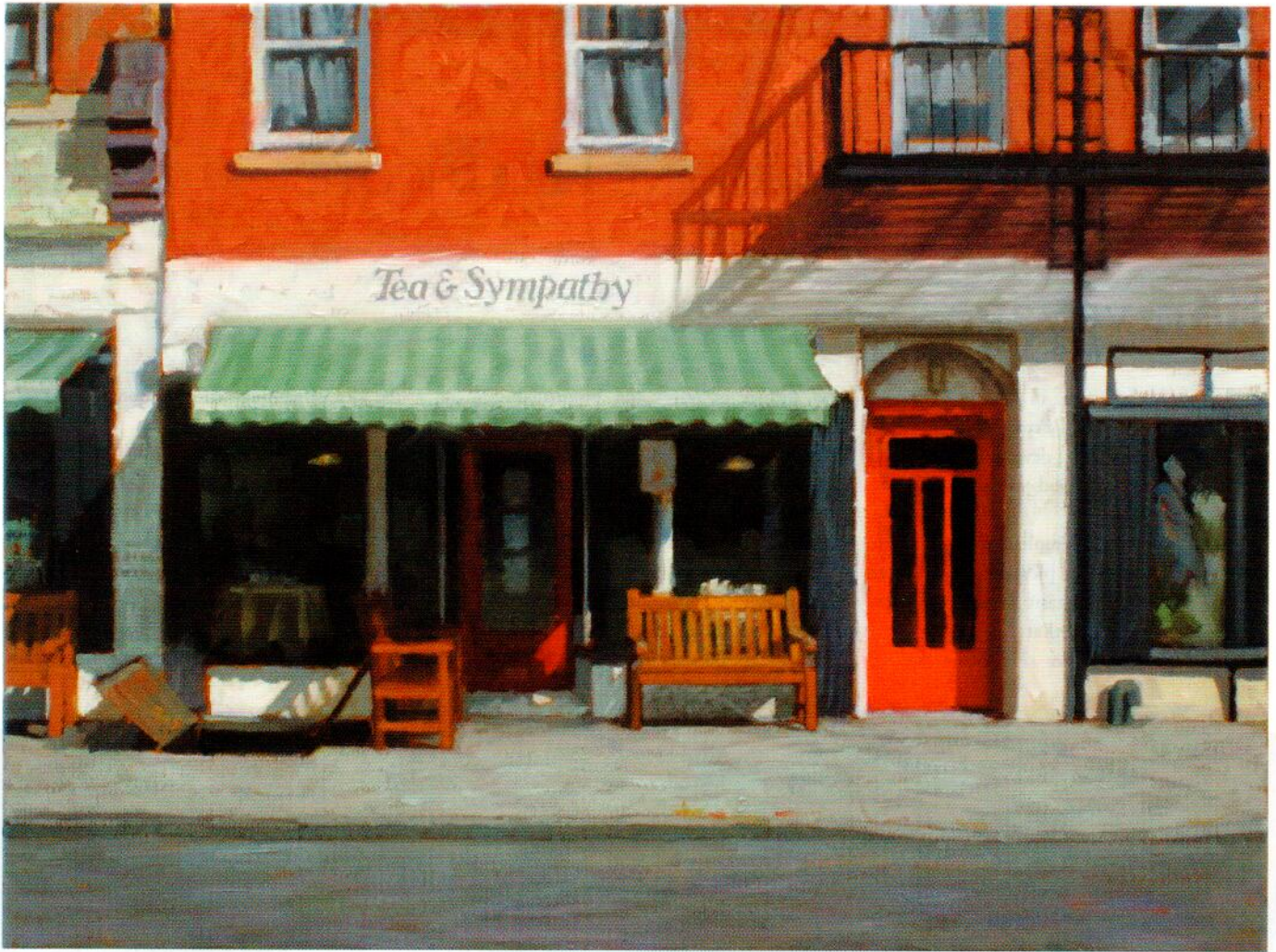
TEA & SYMPATHY, OIL ON CANVAS, 18 X 24"