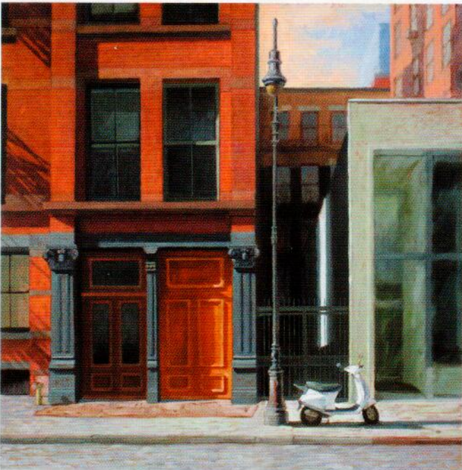
URBAN TRANSPORT, OIL ON CANVAS, 36 X 36"