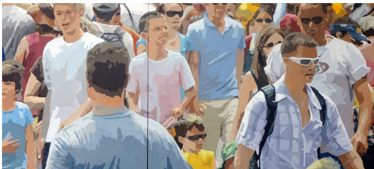
Crowd (Composition #11), gouache on panel, 8x18"

The George Billis Gallery marks its 20th year in the Chelsea Art district and its sister gallery is located in the burgeoning gallery district of Culver City in Los Angeles. For more information, please contact the gallery via e-mail at gallery@georgebillis.com or visit our website at www.georgebillis.com .