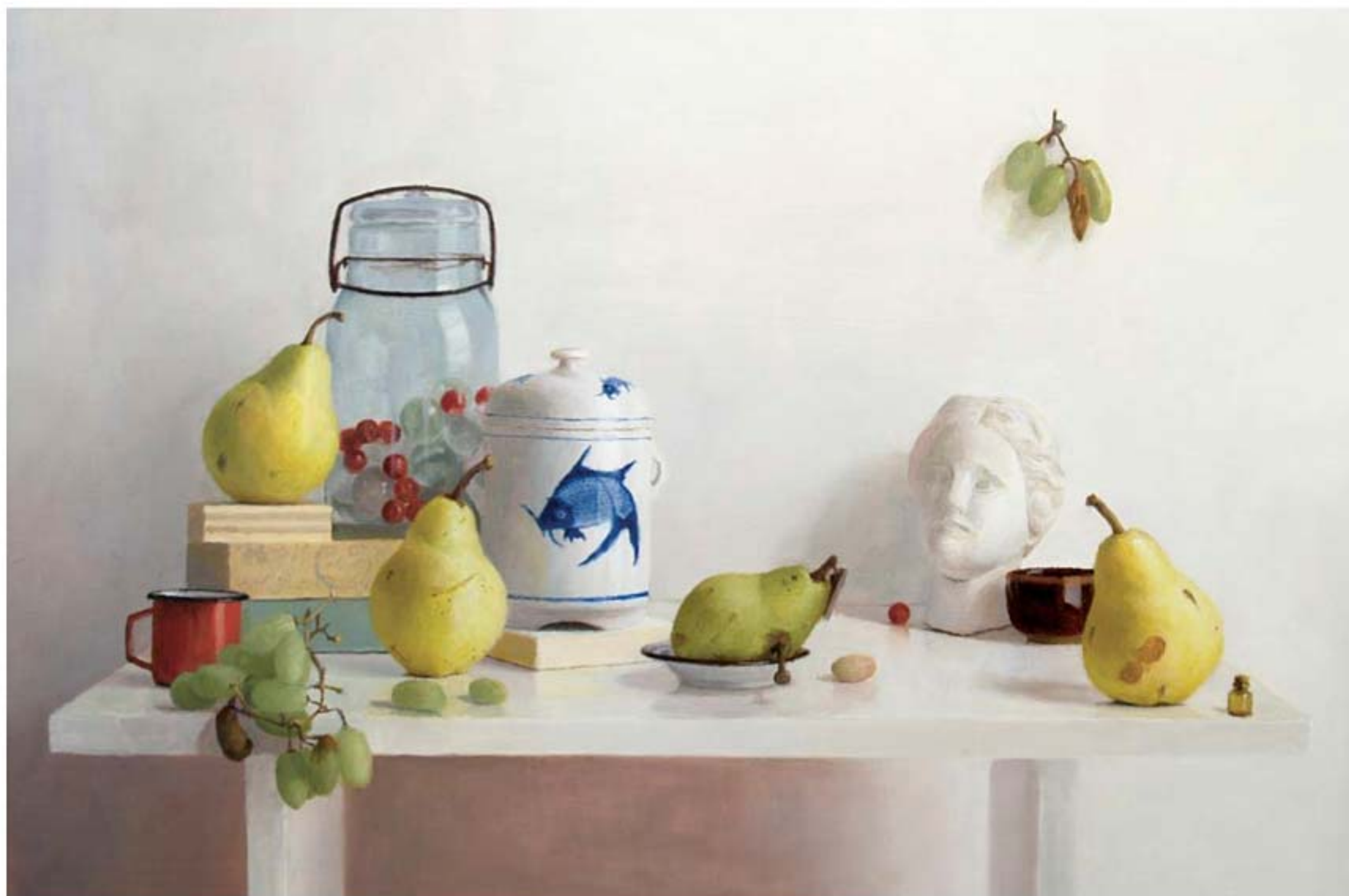
CONFIGURATION WITH VENUS, OIL ON PANEL, 16 X 24"