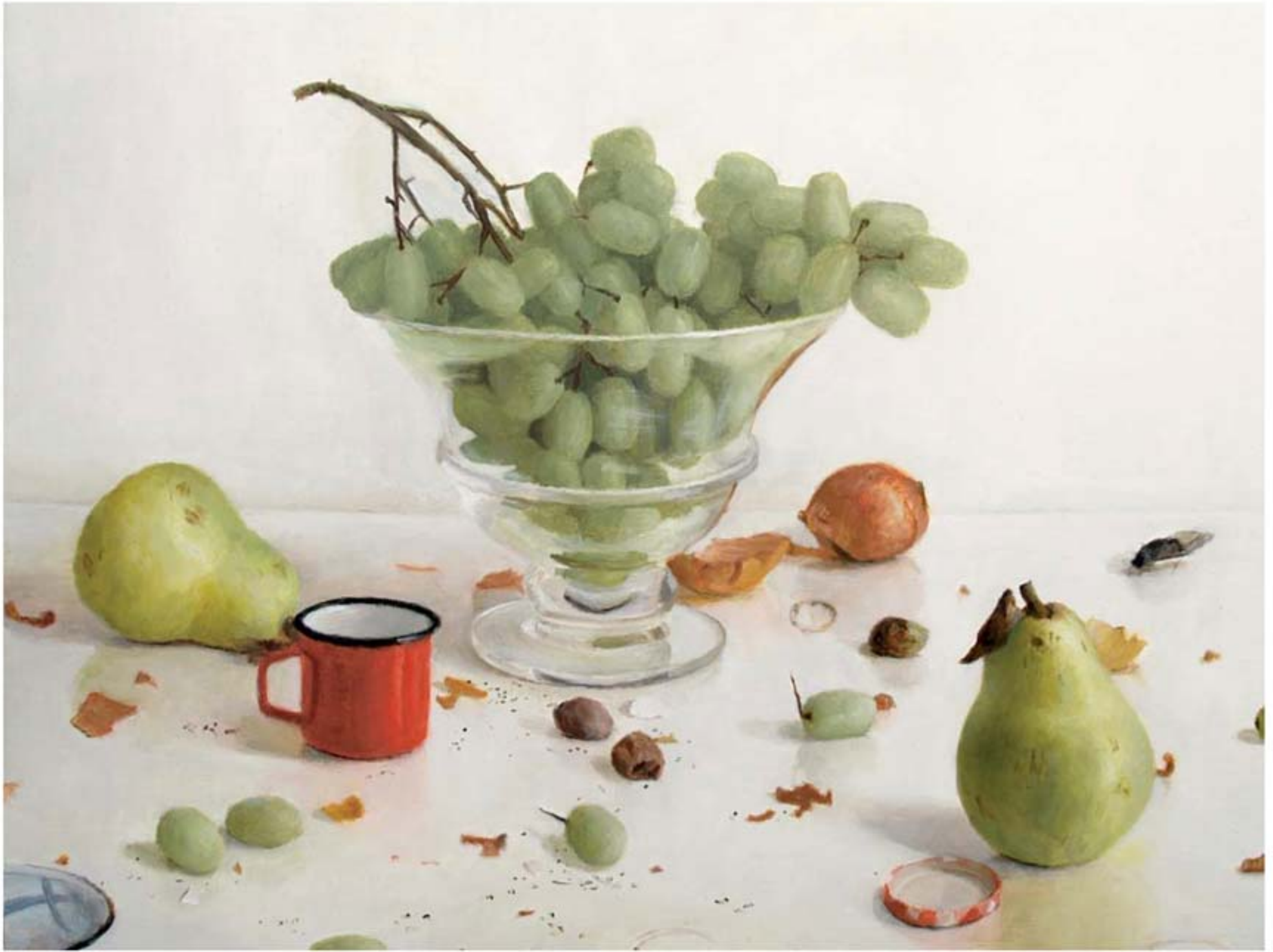
GRAPES WITH PEARS AND RED CUP, OIL ON PANEL, 12 X 16"