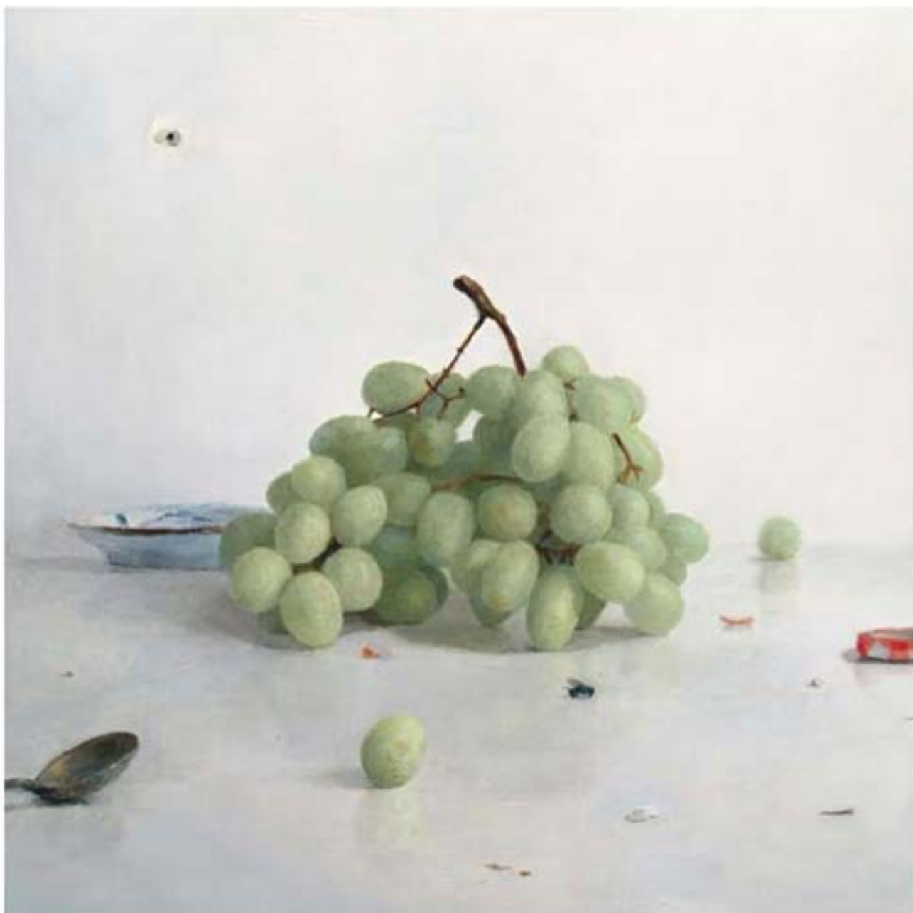
GRAPES, OIL ON PANEL, 12 X 12"