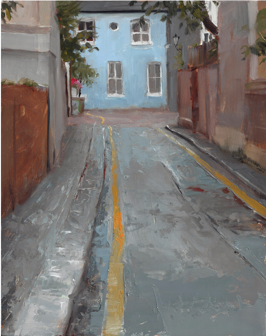
A London Lane , oil on panel, 10x8"