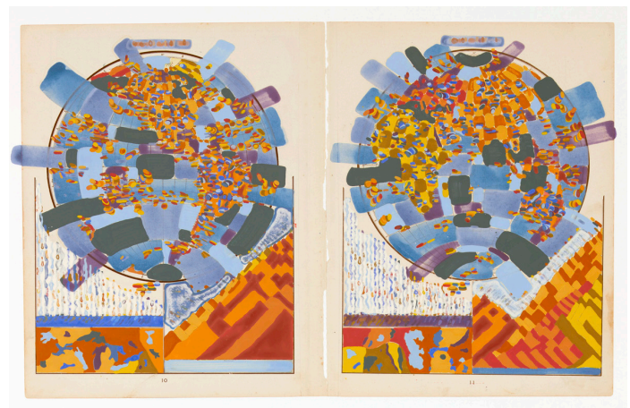
Rivoj, Lagoj, kaj Montoj, 2013-14, acrylic on printed map on paper. 22 1/2 x 30" (detail)