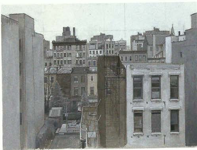
THE GUTTED BUILDING STUDY, GRAPHITE AND ACRYLIC ON PANEL, 15 X 30"