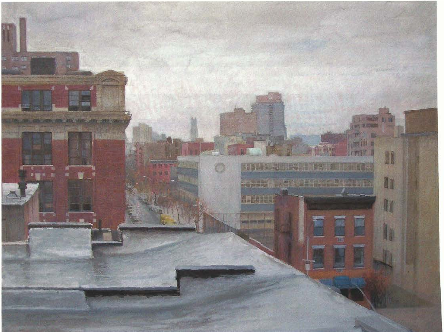
WEST WINDOW, OVERCAST, ACRYLIC ON BOARD, 9 X 12"

Vadnais' pieces typically are generalized, and he eliminates elements of the scenes such as cars. On the other hand, forms and structures that he paints or sketches tend to be specific. This lends for an overall idea of a place rather than an exact time. "I am trying to get away from it being a snapshot," he says. "It's a place divorced from a particular time. It's not a moment I am painting."