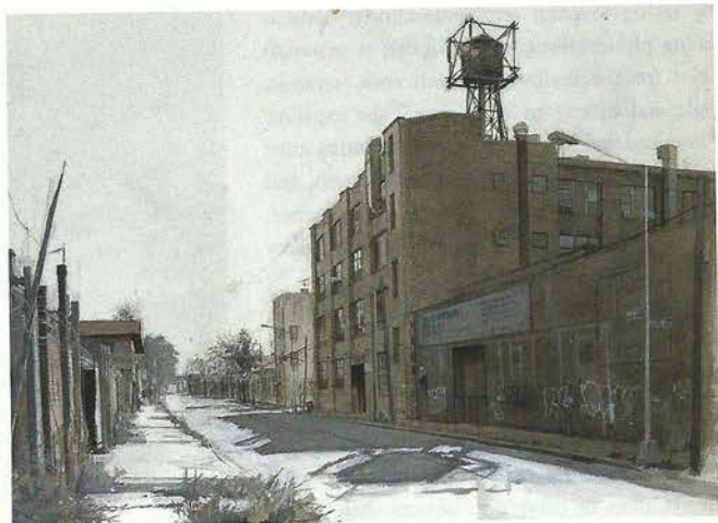
THIRD WARD, GRAPHITE AND ACRYLIC ON PANEL, 11 X 15"

With a studio in Bushwick and a home in the Upper East Side, Vadnais finds inspiration from his surroundings. Vantage points in his paintings are from all over including his window view. Many of the pieces also represent different impressions of the same subject with varying lighting and views. For example, The Guttred Building has three versions.