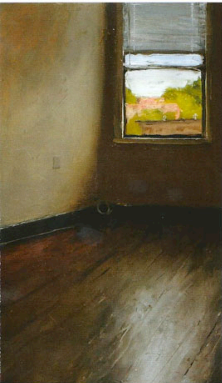
EMILIO'S FLOOR, BEACON, NY, OIL ON PANEL, 12 X 8"