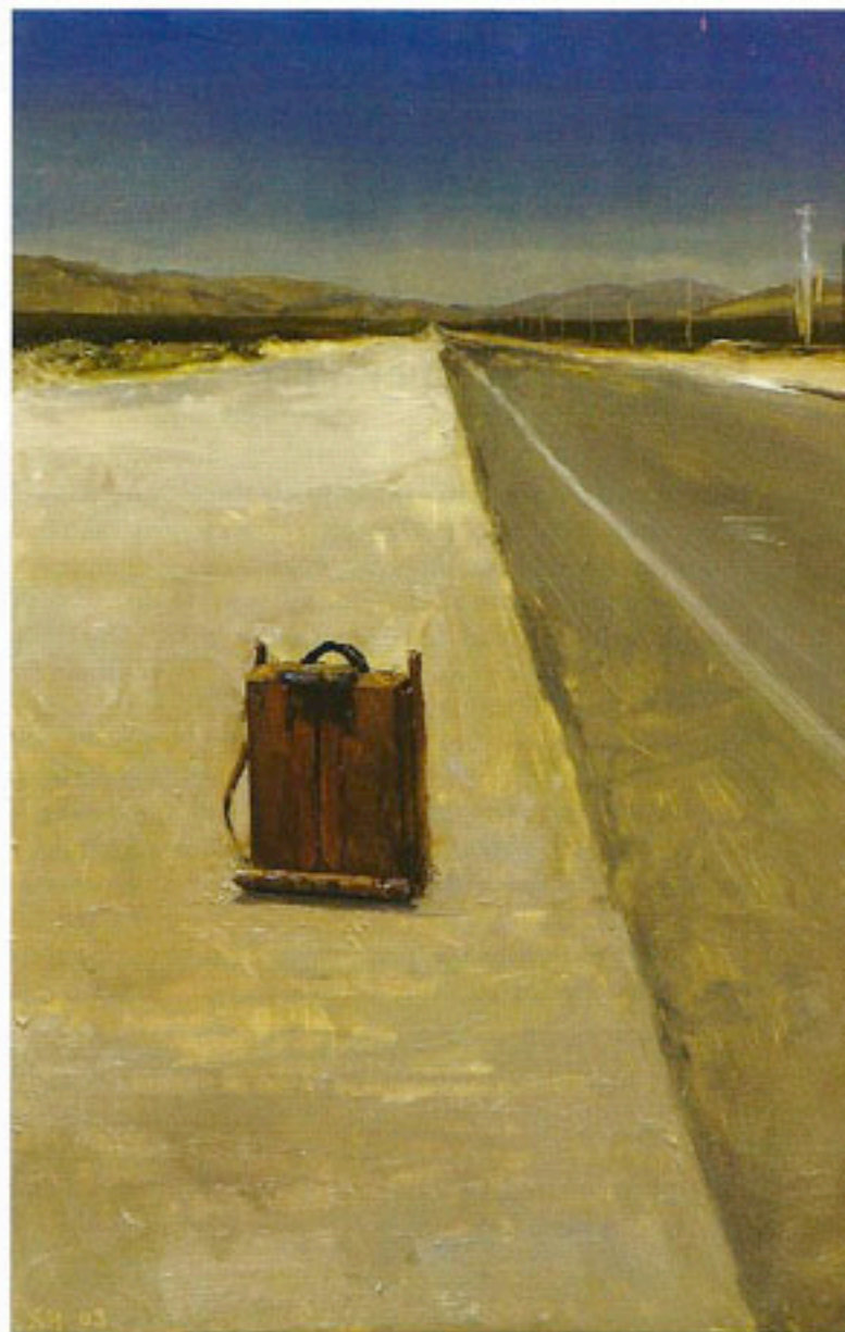
PAINTBOX EASEL BY THE HIGHWAY, STATELINE, NEVADA, OIL ON PANEL, 12 X 8"

I slept on, street scenes of small towns, a derelict loft above a convenience store. What ties them together, though, is that they are all things I saw and I connected with and touched me in some way. I'm exhausted from the trip and am still recovering."