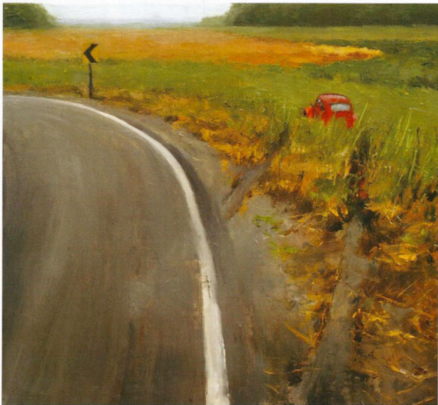
BEYBLE SKID-OUT, MISSOURI, OIL ON CANVAS, 16 X 18"