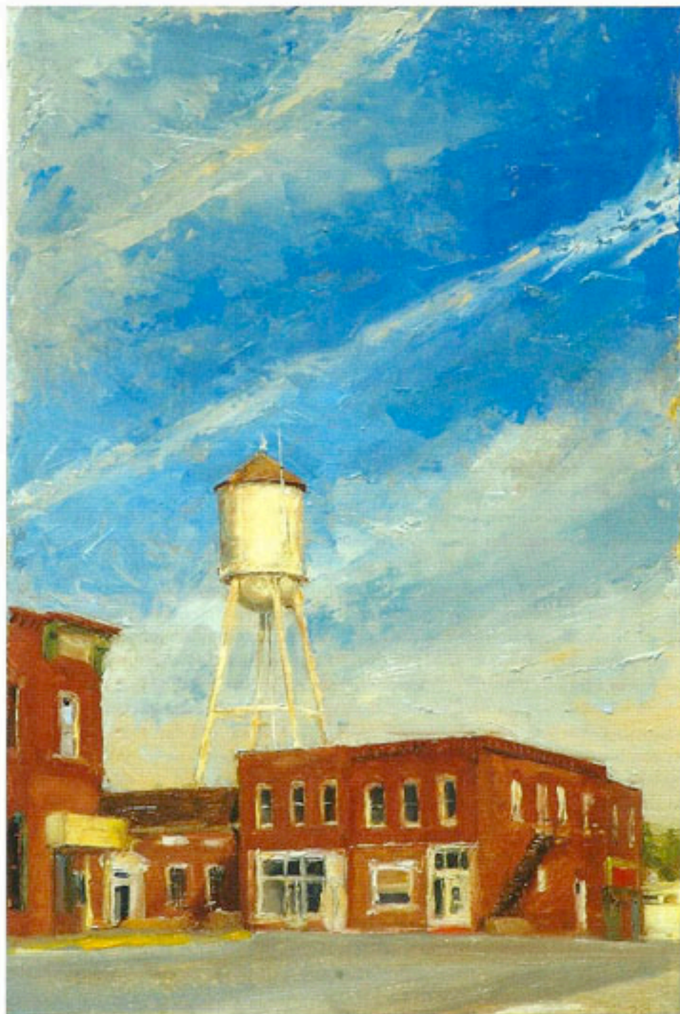
WATERTOWER, WINDSOR, MO, OIL ON CANVAS, 12 X 8"

"The work in the show is really a mixture of things," says Harris. "Some landscapes, some interiors, some of the floors I slept on, the couches