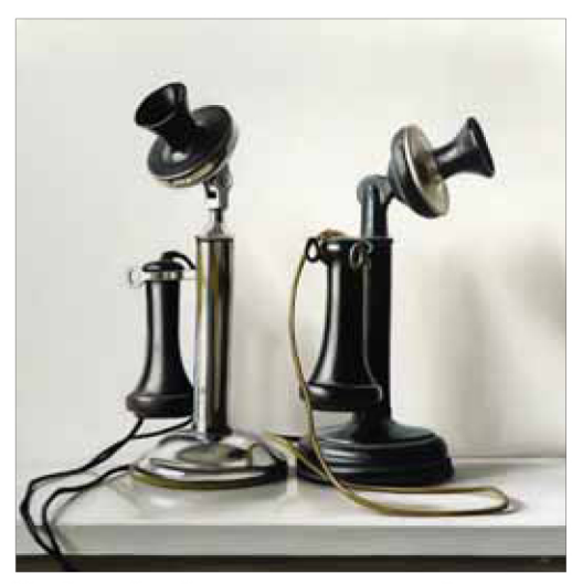
Two Candle Stick Phones, oil on canvas, 24 x 24 \!\!^{"}