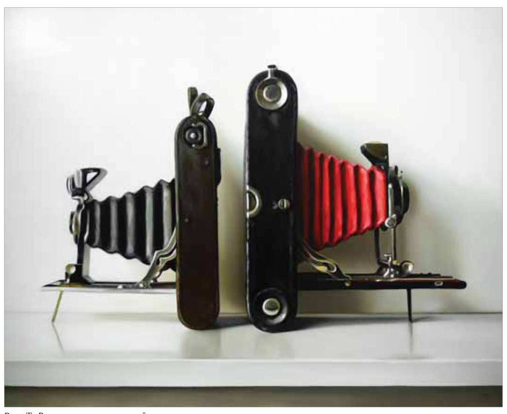
Back To Back, oil on canvas, 24 x 30"