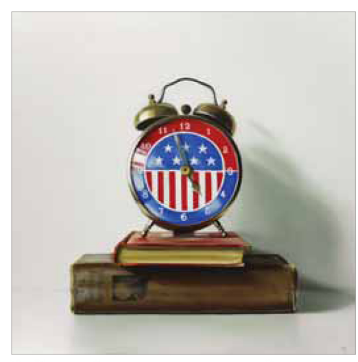
The Vanishing American, oil on canvas, 24 x 24 \!\!^{"}