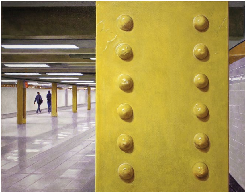
6 Saying Grace, oil on canvas, 37 x 35"