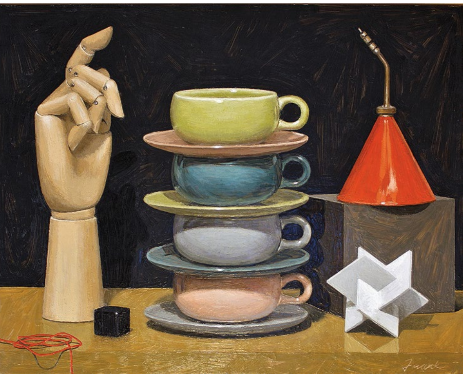
1 Vertebrata , encaustic on wood panel, 16 x 20"

"Giving them a dramatic baroque treatment using Old Master techniques is a way to elevate the schlocky things that were ubiquitous in my youth...and with the Rockwell pieces, it's interesting to take a