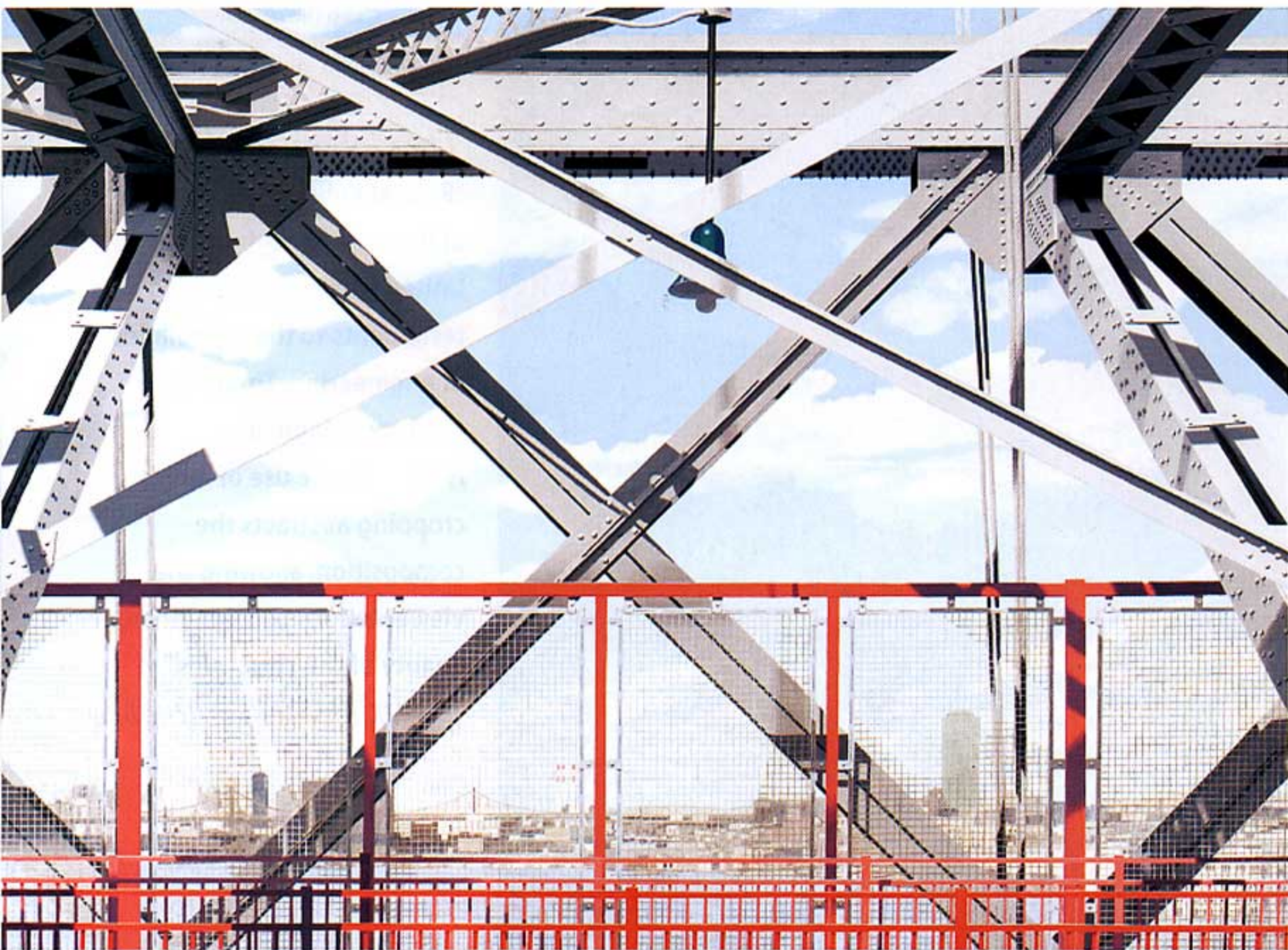
▲ ROLAND KULLA, WILLIAMSBURG, OIL ON CANVAS, 43 X 60"