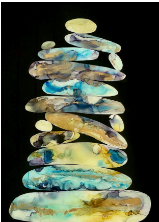
Melissa Mack, Balance 2, ink, acrylic on wood, 16x12"

LEE KRASNER was a major Abstract Expressionist painter who painted with large gestural brushwork. Krasner's large-scale canvases reflect these concerns for markmaking as well as an infatuation with hieroglyphics and natural forms. The artist also embraced ovular shapes and pink hues. This lithograph is a perfect example of her work in print form. Krasner studied at the Women's Art School at Cooper Union, the National Academy of Design, and the Art Students League. Krasner's work belongs in the collections of the Metropolitan Museum of Art, the Museum of Modern Art, the Whitney Museum of American Art, the Tate and more.